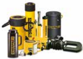
Cylinders & Lifting Products