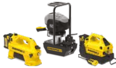
Cordless Hydraulic Pumps