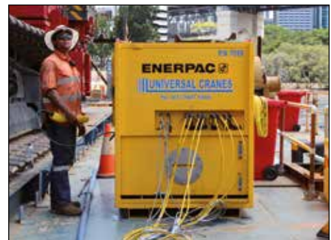
▼ SyncHoist Powerpack to operate the 4 lifting points.