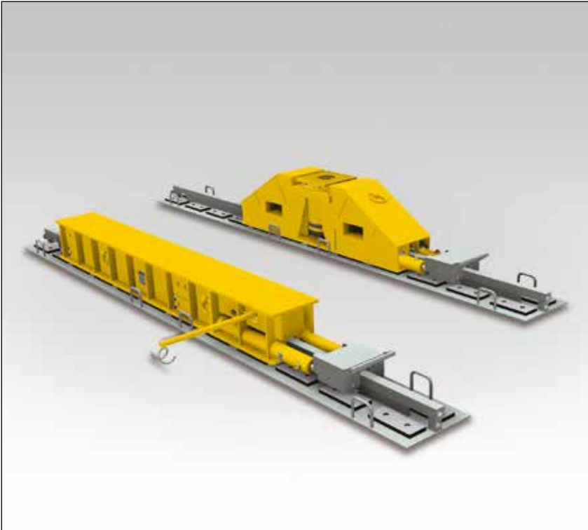
▼ Shown: HSK1250 Skidding System