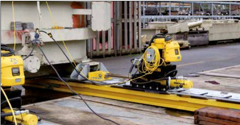
▼ A custom hydraulic Low Height Skidding System (HSLH) will provide the maintenance team with the ability to maneuver and transport transformers with physical access limitations.