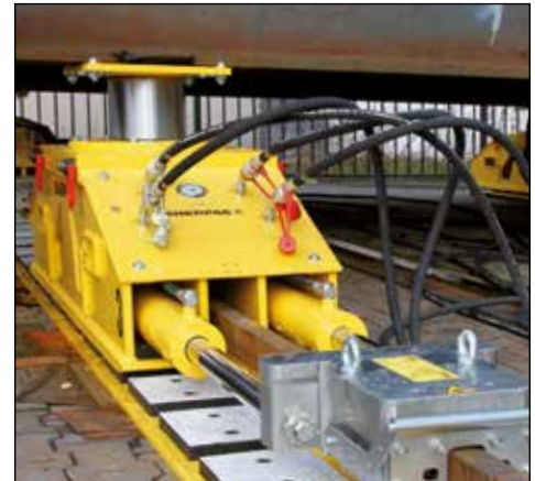
▼ HSKJ-2500 Skid Shoe Jack.

Manual controls offer a cost-effective solution by utilizing manual hydraulic valves mounted directly on the skidding system power unit.